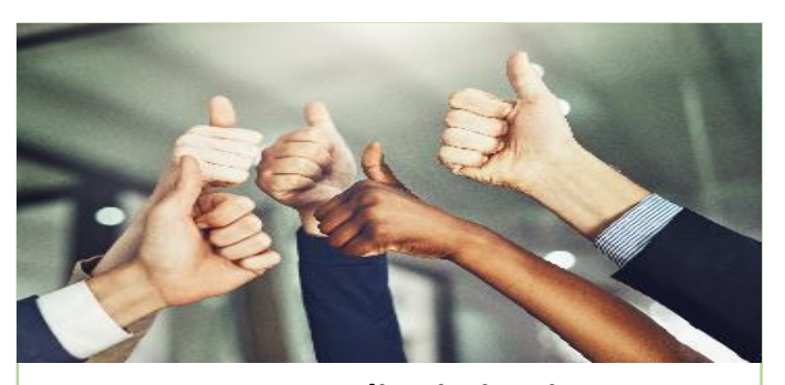
Ensure no discrimination

Maintain the employee turnover compared to 2023.