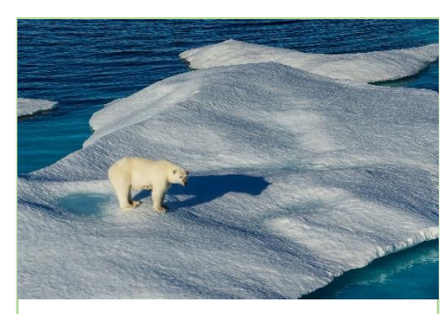
Fight against Climate Change

Report on GHG Emissions for scopes 1 and 2 in France and Belgium and initiate a methodology to report on scope 3.